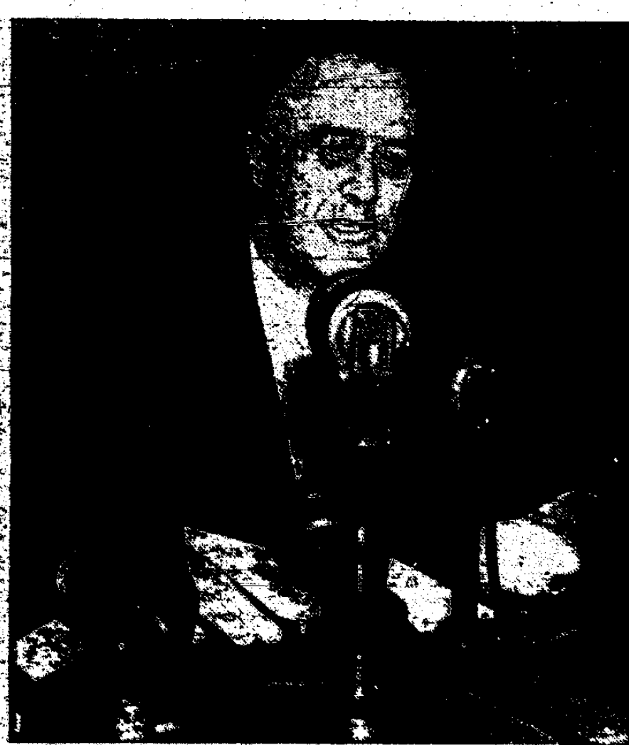
No single voice carries greater weight in the United States than that of President Roosevelt. Shall we hear it demanding justice for the Scottsboro boys!

Can we look forward to a great "liberal" journalist campaign to free the Scottsboro boys? Can we expect a relentless struggle against the Supreme Court? Can we expect an opinion from the